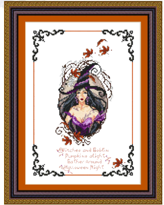
With a off white fabric